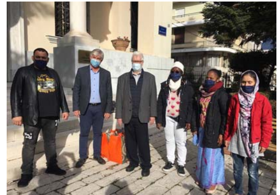
The Mayor of Ioannina during the delivery of the masks offered by refugees to the Social Grocery of the Municipality

Ioannina declares in practice its commitment to be an inclusive city from the local to the international level. As part of the ongoing actions to address the impacts of the pandemic, the beneficiaries of the “ESTIA” program hosted in the Facility of Agia Eleni with the support of INTERSOS Hellas and the United Nations High Commissioner for Refugees, made a particularly important gesture of solidarity, donating 565 fabric masks to the Municipality of Ioannina to be distributed to vulnerable social groups through the Social Grocery. The delivery of the masks took place at the City Hall with the Mayor and the President of the Organization for Social Protection, Solidarity and Preschool Education.